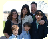
Jamieson and Lydia Herman Children's Ministry